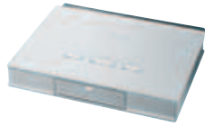
PCSA-DSB1S Data Solution Box