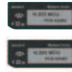
PCS-323M1 H.323 MCU Software